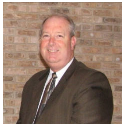
March 25 th Guest Speaker: